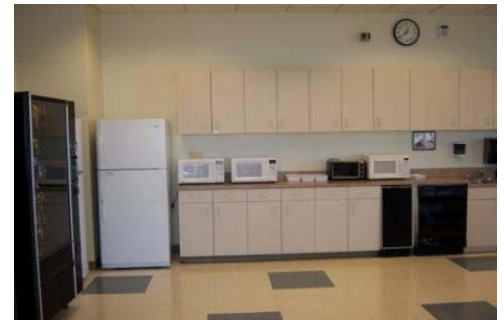
Kitchen / Break room