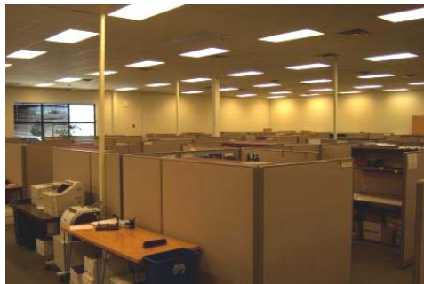
Open office area