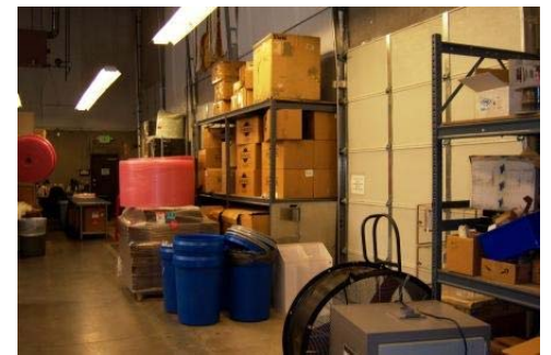
Shipping / Receiving area